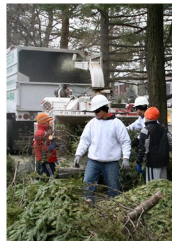
Volunteers get ready to send the trees through the mulcher.

CHRISTMAS TREE RECYCLING January 9, 2010, 9:00 a.m. to 12 noon at the Congregational Church of Manhasset. Trees can also be dropped off the night before after 5:00 p.m. and left in the grass circle in the middle of the Church's parking lot. Bring a strong bag or container to take home free mulch!