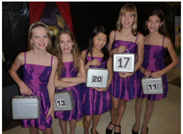
TECHNOLOGY COMMITTEE Halloween fun with Deal or No Deal models captured and stored on CDs.