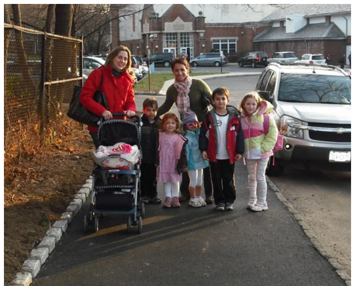
THE SAFETY COMMITTEE A new walkway was created to ensure the safety of walkers through our busy parking lot.