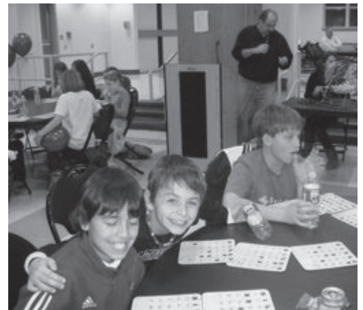
Last year's Tower Foundation Bingo Nights were a big success

4th Election Day 11th Veterans Day 19th Conferences 27th & 28th Thanksgiving