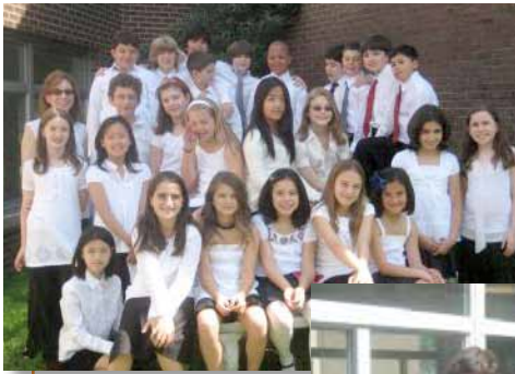
The 4th grade Spring Choral Concert