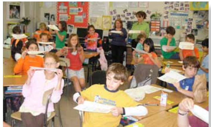
Fourth graders learn to 'see things differently' with a visual disability exercise.

Thanks to all the fourth graders and their teachers for participating in the presentation!