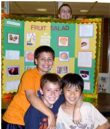
5th graders at the Science Fair