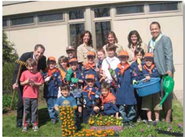
The Cub Scouts worked really hard, and together as a team, to beautify Shelter Rock's grounds.