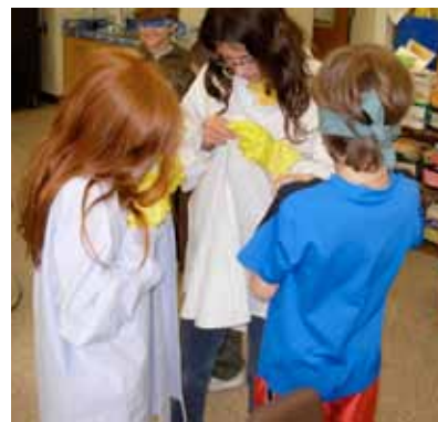
Having fun and learning about how challenging everyday tasks like buttoning shirts and tying shoes can be to people with special needs.