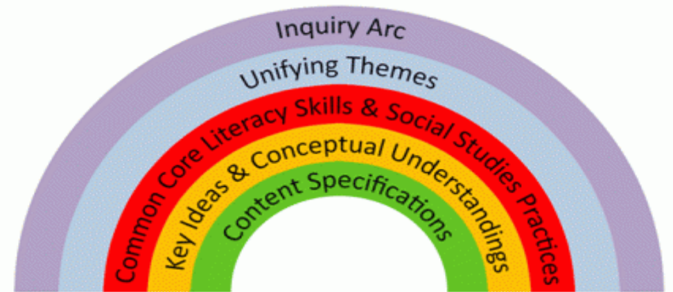
Figure 1: Components of NYS K-12 Social Studies